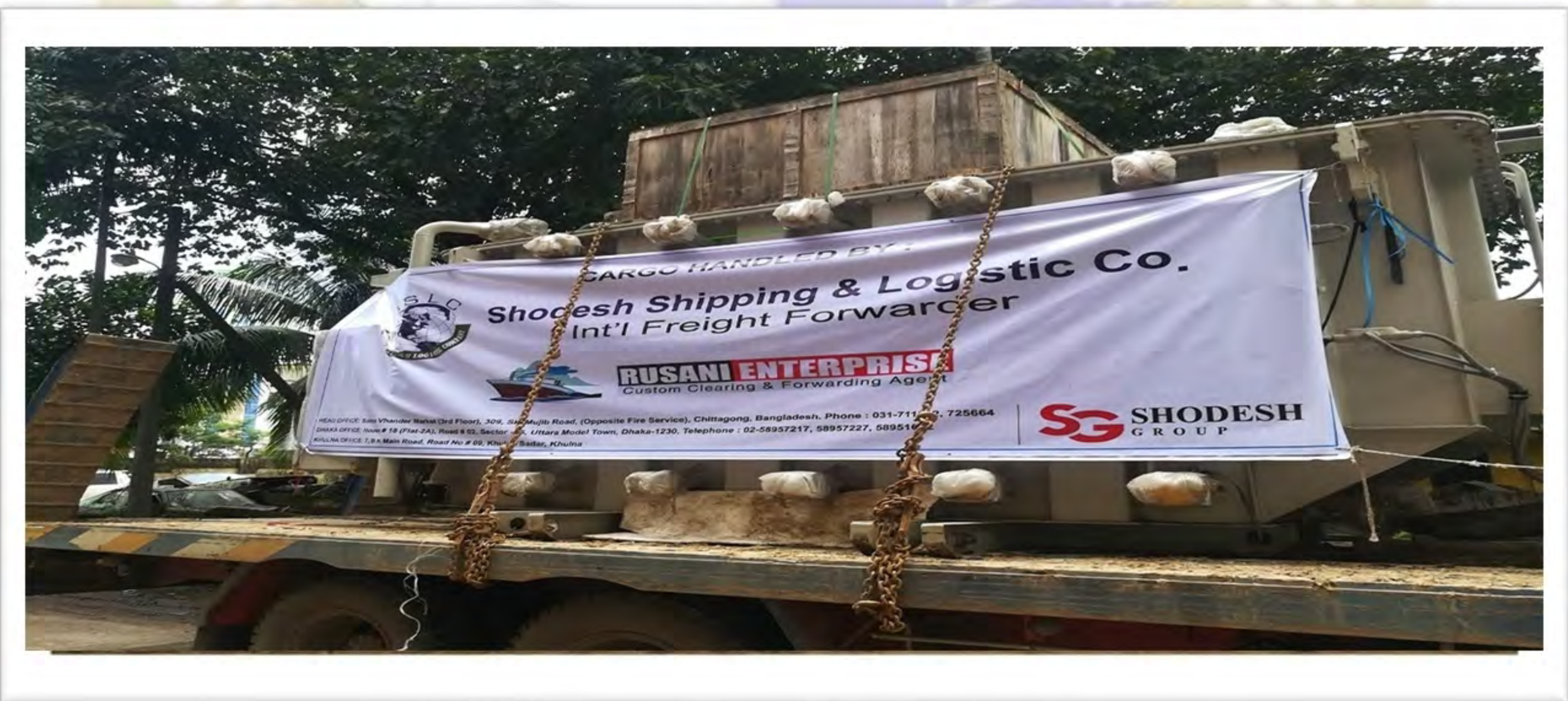
Chittagong 22 substation Project by CEC & BPDB