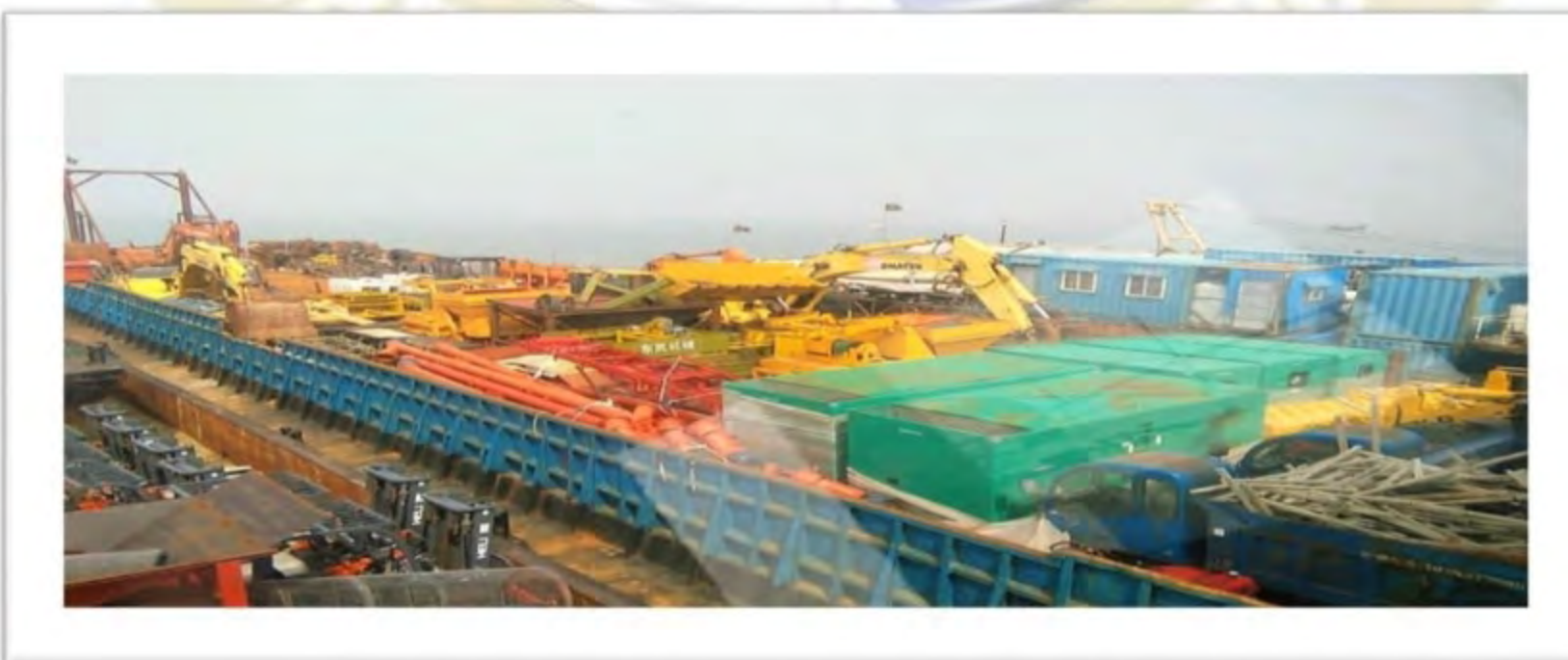
SEMI SUBMERGE HANDLING FOR CHINA HARBOUR MIRASARAI ECONOMIC ZONE PROJECT.