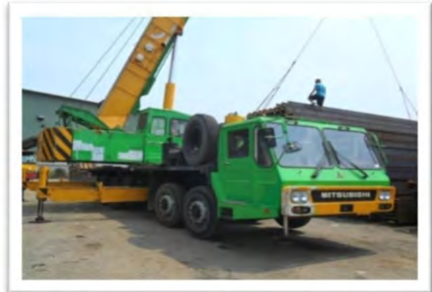
HYDRAULIC GROVE CRANE