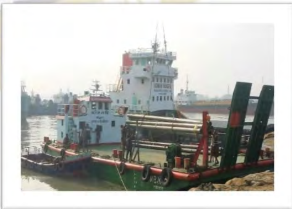
JHULDA PROJECT -100MW POWER PLANT PROJECT.