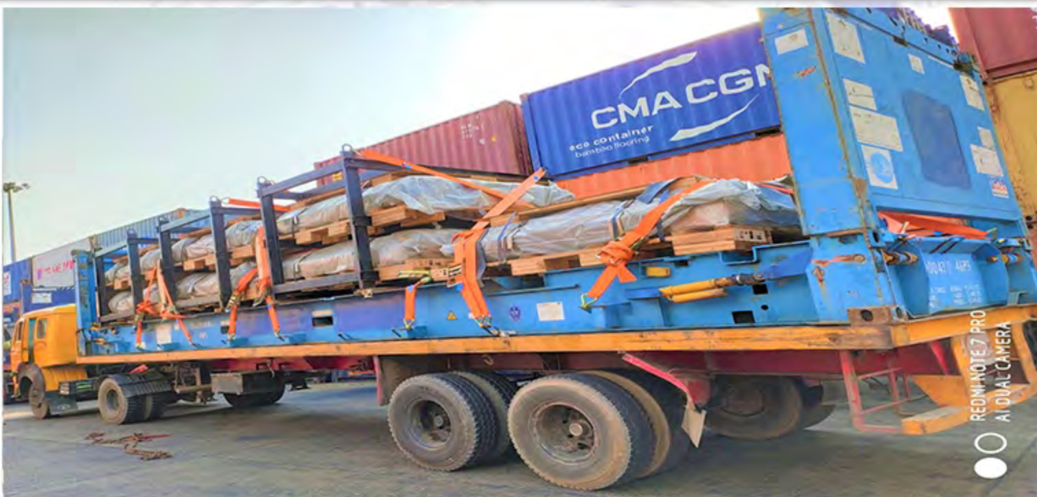
ROOPPUR NPP PROJECT